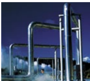
Above: Contact Energy Wairakei Geothermal Power Station

a chance this relationship is taken too far. If this is the case CEN could become the vehicle for ORG's E&P investments locally. Such a scenario could alter the risk of the business and be to the detriment of cash flow and dividend payouts. ORG presently has a 40% dividend payout and uses the remainder to fund its E&P activities. Meantime, CEN maintains a payout of close to 100% and to date has very little E&P focus.