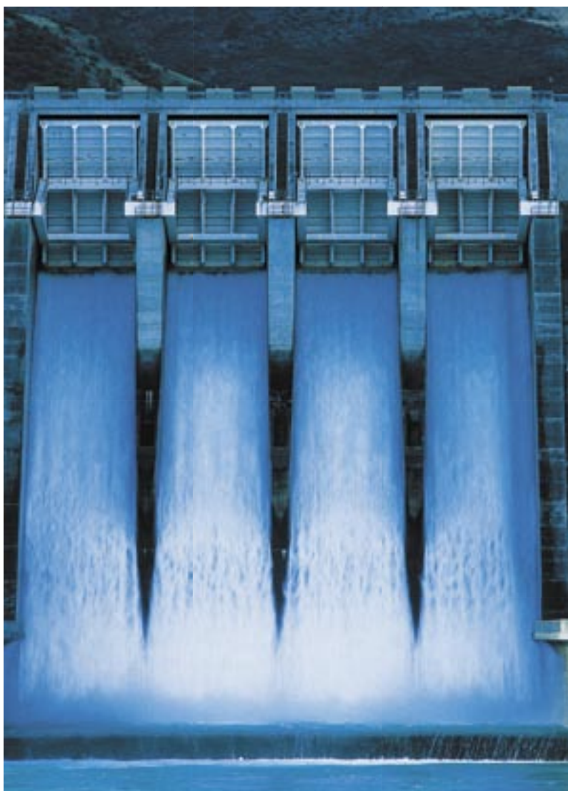
Left: Contact Energy Clyde Dam

catalysts and an assumption that some of the upside is already factored into the share price, rival broker Direct Broking expects CEN to range-trade between $5.80 and $6.20. Taking a slightly more robust outlook, ABN Amro maintains its ADD recommendation with a DCF valuation of $6.38.